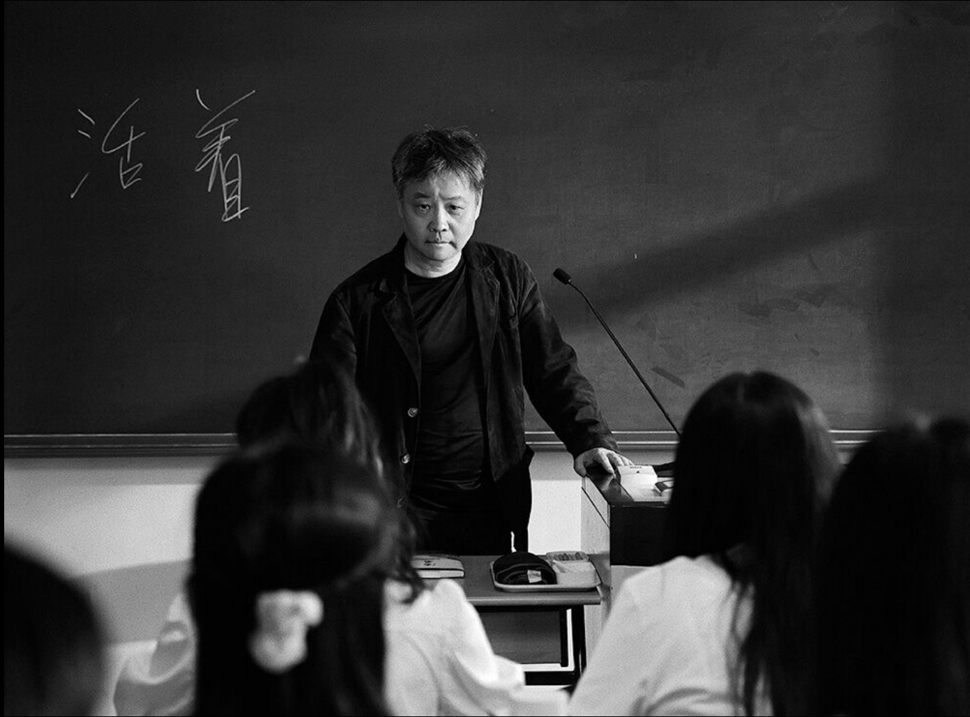
Yū Hua (2021)