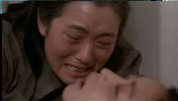
Scenes from To Live movie adaptation (1994)