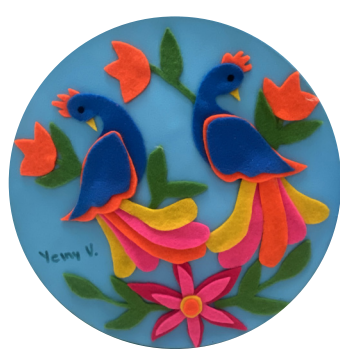
Birds of Hope

The hummingbird represents sweetness and movement, and they are a complement to flowers. It is said that there is a flower for each species of hummingbird.