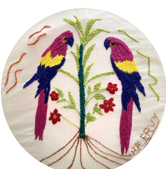
Pair of Macaws

These drums represent the biodiversity we have in the Amazon. Animals, plants, and landscapes.