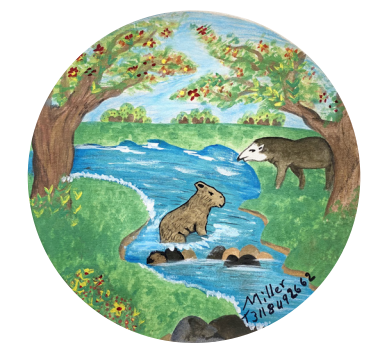
Tapir and Chigüiro in the River.

This is how I remember the territory I inhabited before being dispossessed by the armed conflict: abundant, peaceful, beautiful.