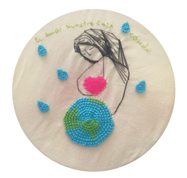
Love Our Common Home

Love is our common home. Mother/father our planet Earth, our natural vessel, is the ultimate expression of love. It shelters us indiscriminately, sustains us, sustains us. Beyond any system that exceeds the limits of Mother Earth, the planet is the home in which we travel. To her, Mother, we owe all respect and devotion... As one who cares for her home, her own loving body.