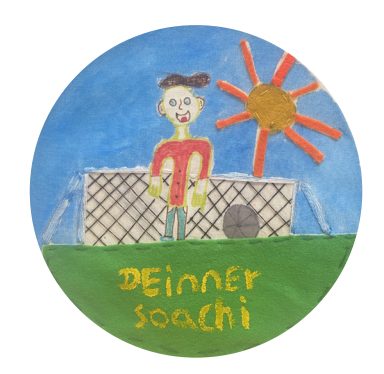
The Soccer Player

I made myself by being a soccer player, that's what I do in my free time and it's my favorite sport, the one I like the most.