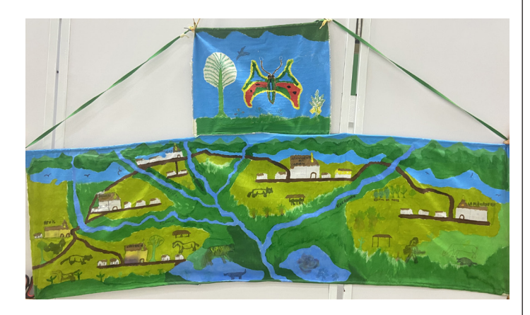
Map of Caquetá

The new beginning towards a better future. With all the circumstances and obstacles that we have crossed in history, we cannot forget what our parents and grandparents taught us, because we have a sense of belonging. That is in our thoughts and in our hearts. Many of us yearn to have a little piece of land to be able to produce and return to have a quiet peace, because in the city we live in despair, and in despair, there is no tranquility.