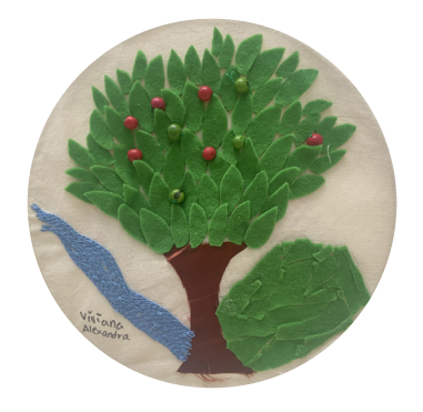
The Inspiration of a Tree with the Family

I wanted to get ahead because of my daughter. I wanted to make the tree, because one feels free, to go to the tree to sit and listen to the river and see the mountain. It's like being with my daughter, being with my family.