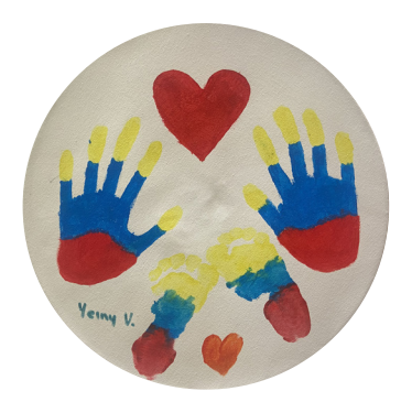
We Want Peace

In this piece there is a beaten woman who asks for peace, to be more valued as a woman and to be considered.