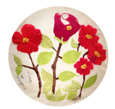
Love of Nature

It is incredible that nature cries out for help, but the most incredible thing is that no one listens to her. Please, let's love and take care of nature, she needs us, and we need her to live.