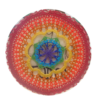
We All Fit Here

There is only one sun that shelters us, and our common home is our land, which welcomes us without distinction.