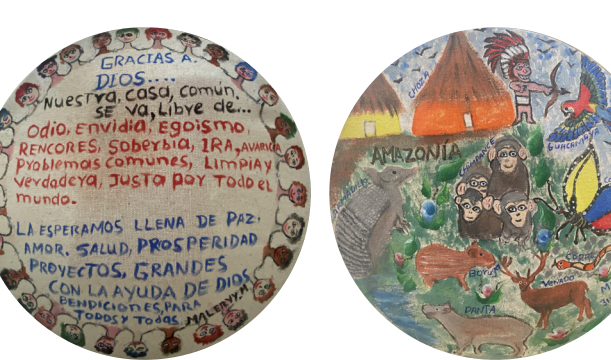
How to Learn to Live

I also made plants because I really like naturopathic medicine and flowers.