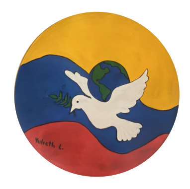
The Voice of Kidnapping and Forced Displacement

The peacock with recyclable materials represents the colors of life, as well as the macaw and the orchid. Even if one suffers, one must bring color and laughter to the world, because we must leave our own little footprint of love.