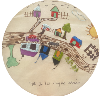
The Little House of my Joys and Sorrows

This exercise reminded me of my childhood, when I was studying, weaving and painting. On this canvas I made a basket with medicinal plants and on the other side a heart. I did it with a lot of love knowing that we must be aware of things and that life goes on in spite of everything that happens. We have to heal the sadness.