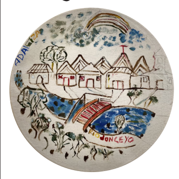
The Tranquility in the Field and the Sadness When Leaving It

I lived my childhood in Santafé del Caguán, after being displaced from Curillo, Caquetá. We left the joy and were left with the sadness of leaving everything we had. Thank God we are alive to tell that story. I want to capture part of my childhood or what was on the farm when we lived with my mother and brothers. We fed ourselves with corn, yucca, plantain, and that was the happiness of the countryside. Corn means the countryside, abundance.