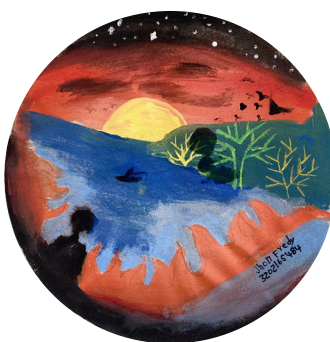
Red Sunset on The River

The sunset reflects the place I lost when we were displaced by the armed conflict.