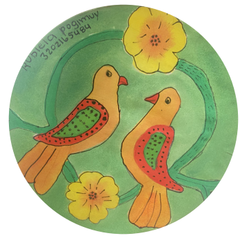
Two Yellow Turtledoves on a Green Background