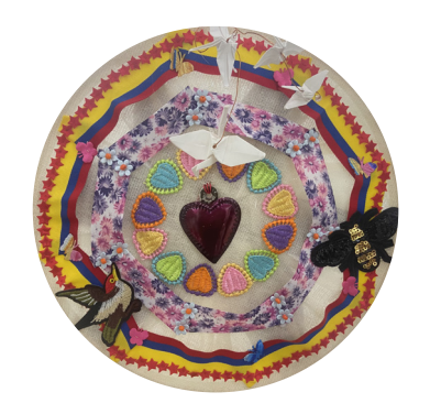
Hearts of Peace

The union of Colombian hearts will lead us to weave peace among people and with nature.