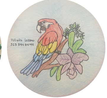
The Colors of Life

The peacock with recyclable materials represents the colors of life, as well as the macaw and the orchid. Even if one suffers, one must bring color and laughter to the world, because we must leave our own little footprint of love.