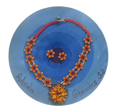
Happy Weaving Memory

With beads I wove a necklace and a couple of earrings on a circle that fades from dark to light blue, because for me this color means purity, the sky, the firmament. Making this piece cleared my memory. In the Weaving Memory project I have been able to tell a part of what has happened to me, for example I have been able to talk about the death of my mother and father, and that of my little brothers and sisters. Anyway, happiness doesn't end, I keep going forward because I have a future.