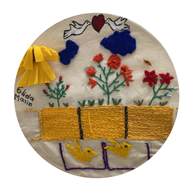
Memories of my Childhood

I tried to make my little house like a brick house, I made some trees and a little dove. The trees are nature, having trees at the foot of the house gives a lot of tranquility, a lot of freshness. The little dove is for the peace that we all should have, to be calm, not to be accelerated and to be good people with everybody.