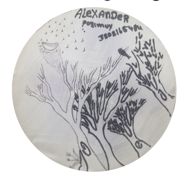
Black and White Drawing

This is how the trees were left because of the smoke, bombs and gunshots that multiplied during the armed conflict. They destroyed the environment, the trees, the birds, the people. During war desolation is everywhere.