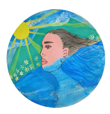
Memories of the Caguán River

I made some roses because I am a flower lover. I have a sick son and he loves flowering plants. He is the garden in bloom.