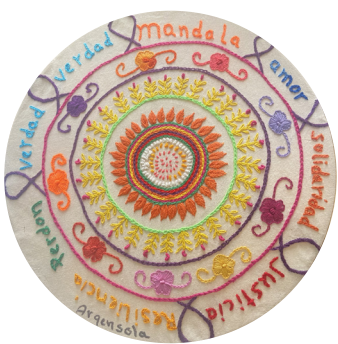
Mandala of Hope

The Tambo of the Embera people is the house that represents the action of spinning and sweetening the solidarity, justice, resilience word.