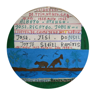
The New Beginning