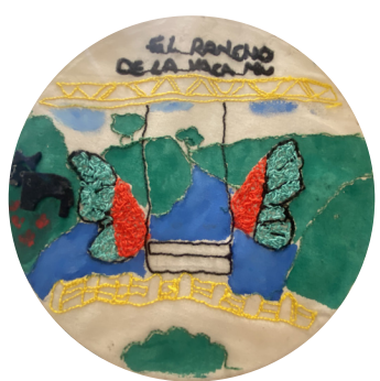
The Moo Cow Ranch

El Portal del Fragua has a beautiful story about a man and a woman who belonged to two different indigenous communities and who were in love. Because they were from different tribes, they were not allowed to live their love, so they made a promise to the universe to always be close even though they could not be together, and their union was captured by nature in a mountain fragmented by a large crack where the Fragua river passes by.