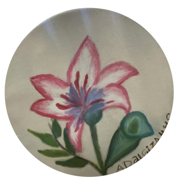
Flower of Joy

I lived my childhood in Santafé del Caguán, after being displaced from Curillo, Caquetá. We left the joy and were left with the sadness of leaving everything we had. Thank God we are alive to tell that story. I want to capture part of my childhood or what was on the farm when we lived with my mother and brothers. We fed ourselves with corn, yucca, plantain, and that was the happiness of the countryside. Corn means the countryside, abundance.