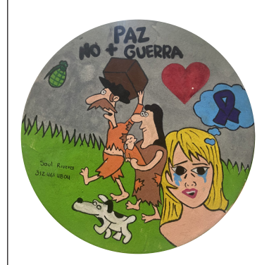
Survivors Of the Armed Conflict

The canangucha palm is shown, which is fundamental for our company, Tropical Fusion of the Amazon.