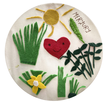
The Plants of my Tranquility

I made these medicinal plants because I feel very calm every time I take them. Since we were in the pandemic panic came into my life and from one moment to the next, I felt very nervous, so I chose to take plants that I had planted in my house such as lemongrass, valerian and chamomile, which gave me tranquility and happiness. Medicinal plants contribute a lot to our mental health and to our daily life, that is why we must sow and take care of them.