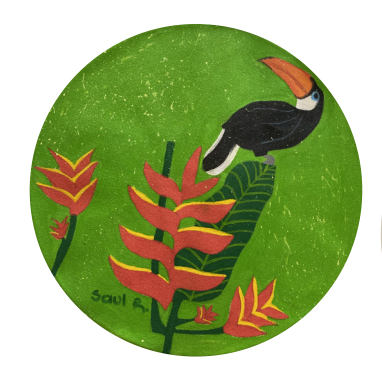
Heliconias and Toucan

The blue represents that we practically look solely to the sky because there is not much to look to the front or to the sides.