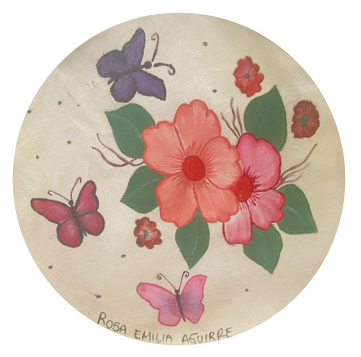
Flowers and Butterflies

Flowers make me think of joy, tranquility and love, and butterflies of the possibilities of transforming oneself to be better.