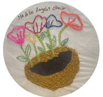
Basket of Flowers

This exercise reminded me of my childhood, when I was studying, weaving and painting. On this canvas I made a basket with medicinal plants and on the other side a heart. I did it with a lot of love knowing that we must be aware of things and that life goes on in spite of everything that happens. We have to heal the sadness.