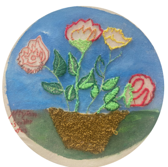
My Son's Roses

I like parrots very much; they are animals that represent Caquetá. I wanted to bring the memory because in the city you don't happy in the house seeing see them much anymore, we see them more in paintings.