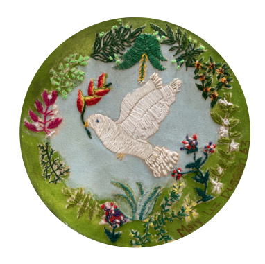
Medicinal Plants Foster Peace

Medicinal plants have been around all the time, during times of conflict and times of peace. I think that medicinal plants welcome peace. I want them and peace to be seen in the territories of the Amazon. The dove, instead of carrying an olive branch, carries a heliconia as a symbol of the territory.