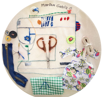
The Sewing Kit

The farm shows everything we had to work and sustain the lives of our families. All this remained illusions because the armed conflict took it away from us.