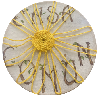
Sun of the Common House

In the Communal House we weave bridges, we cross bridges, we build bridges for peace.