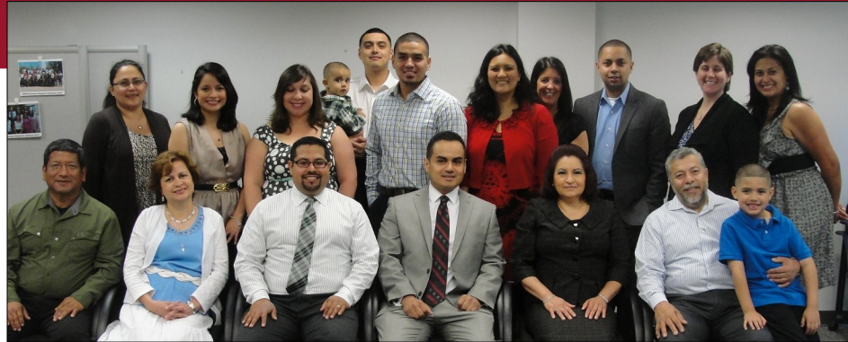
Our 2012 CIE Doctoral Graduates and their families on hooding day

Welcome back and greetings from the Center for Inclusive Education here at Stony Brook University. It is with 'grand gusto' and sincere excitement that I take this opportunity to tell you about the newest developments happening here in the Center. From new programs, to new grant proposals, new post docs and new students, there's novelty and innovation around every corner of the CIE.