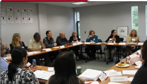
Fall 2011, the planning stages of the IRACDA proposal

This is truly a unique project, and the addition of diversity focused post doctoral fellows to the Center for Inclusive Education community will only strengthen the impact and inroads we stand to make in supporting diversity at the institutional and national levels.