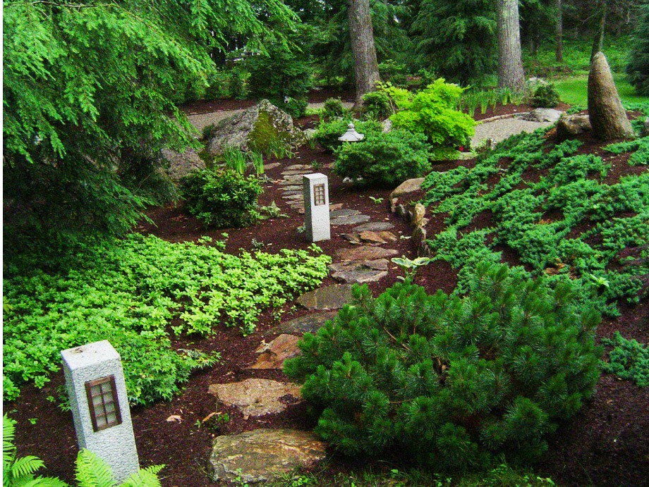
Japanese Garden/Healing Garden, CT©2019 Penguin Environmental Design

Monday, Dec. 2, 2019, 5:30 PM Charles B. Wang Center, Lecture Hall 2