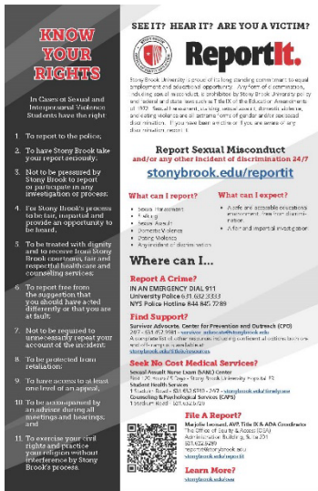
(Click to Enlarge)

https://www.stonybrook.edu/commcms/studentaffairs/cpo/sexual-violence/bill_of_rights.php